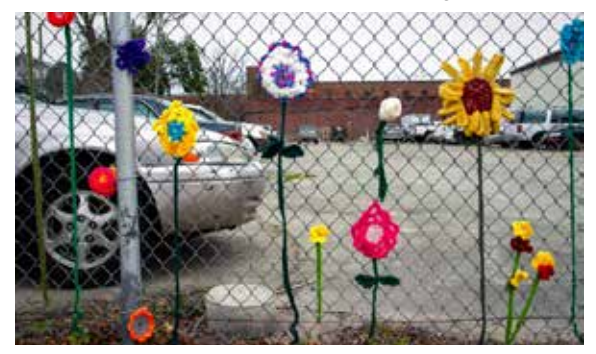
"Crochet Fence" by the Youth Public Arts Project and Community Former Location: Dickinson Ave.

Scholarships are offered to underprivileged children in our community to attend classes and workshops free of charge.