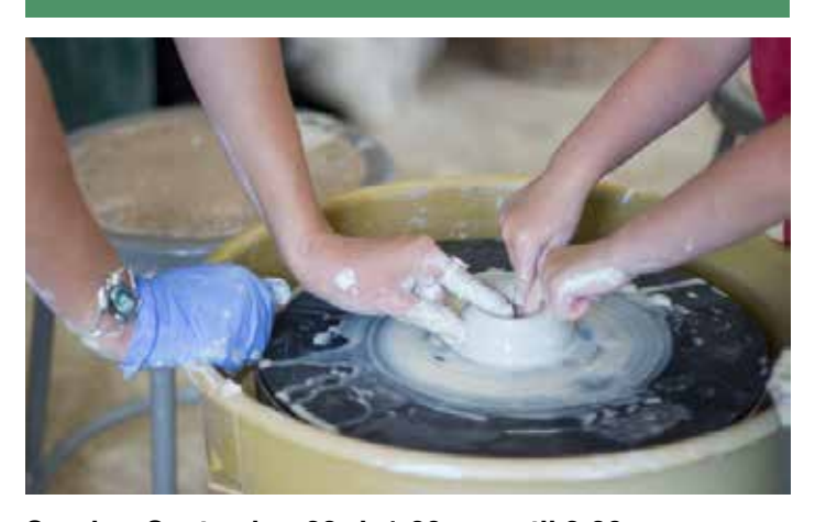
Sunday, September 23rd 1:30pm until 3:30pm (Children Ages 3+ and an Adult)

Participants will learn the basics of working on the potter's wheel. They will learn to wedge, center, and pull the clay to make a simple form. Participants will choose 1 or 2 of their best attempts to be glazed with a beautiful blue.